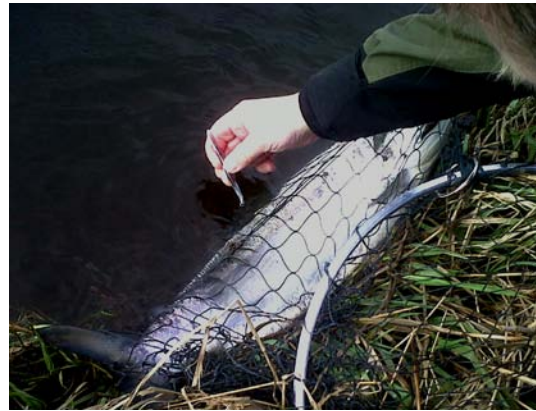
Examples of scales being removed from fish to be returned.